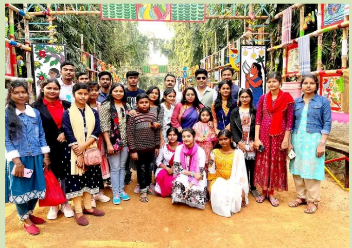
(Department of English)