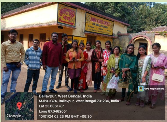
(Department of Sanskrit)

Educational Excurssion was organized by The Department of Sanskrit and also by the Department of English on 10 th January 2024 at Amar Kutir Society, Shantiniketan, Bolpur, Birbhum.